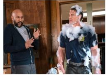
Playing with Fire