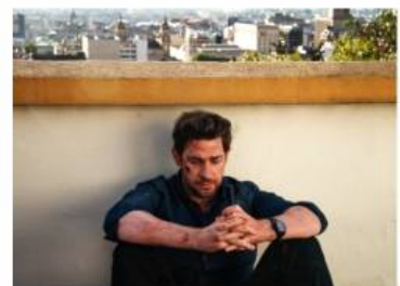
Tom Clancy's Jack Ryan