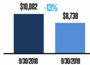
Gross Debt $ in Millions