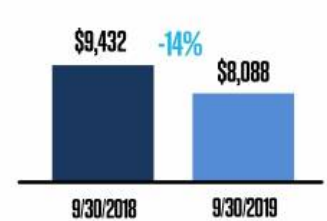
Adjusted Gross Debt *† $ in Millions