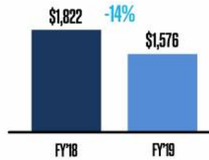
Net Cash Provided by Operating Activities $ in Millions