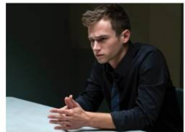
13 Reasons Why