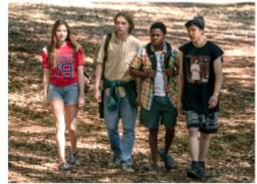
Looking for Alaska