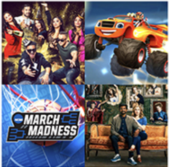
Clockwise from top-left: Jersey Shore Family Vecetion (MTV), Blace on the Monster Machines (Nickeladeon), Ghosta (CBS), NCAA Tournament ICBS Soortal