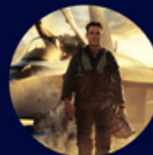
TOP GUN: MAVERICK