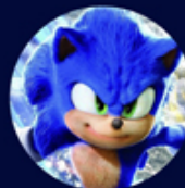
SONIC THE HEDGEHOG 2