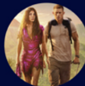
THE LOST CITY